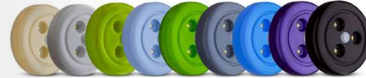
Available in wide range of colours