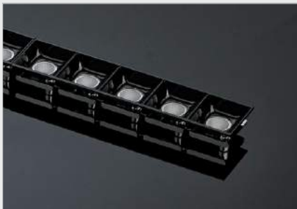
REFLECTOR TYPE 15 DEG AND 30 DEG